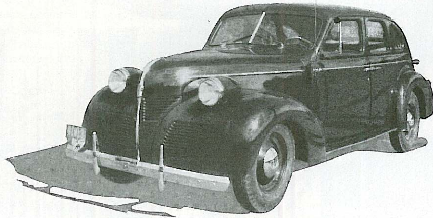
6 seater passenger car PV 60

Wheelbase ..... 2850 mm Overall length ..... 4725 » Overall width ..... 1800 » Track, front ..... 1400 » Track, rear ..... 1515 » Weight-dry ..... 1430 kos